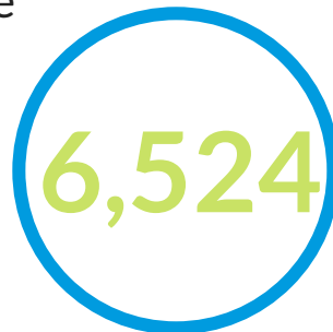
COLUMBIANA DAYTIME POPULATION