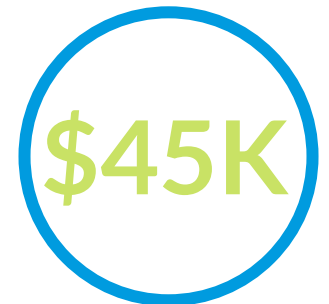
COLUMBIANA MEDIAN HH INCOME